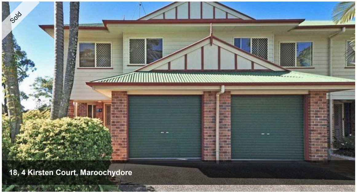
18, 4 Kirsten Court, Maroochydore