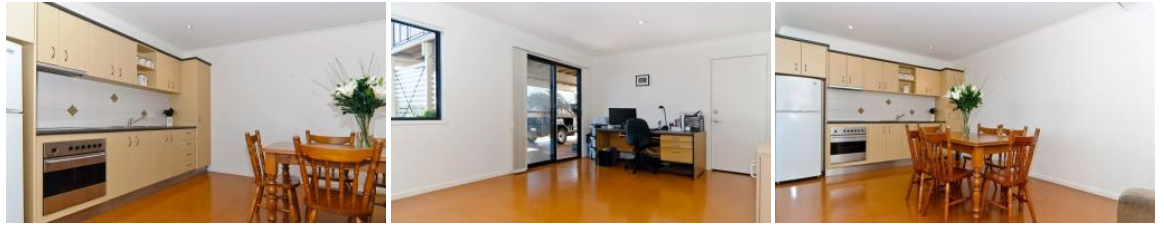
24A Innsbruck Terrace, Mons