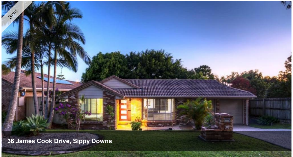
36 James Cook Drive, Sippy Downs