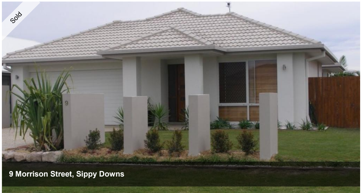
9 Morrison Street, Sippy Downs