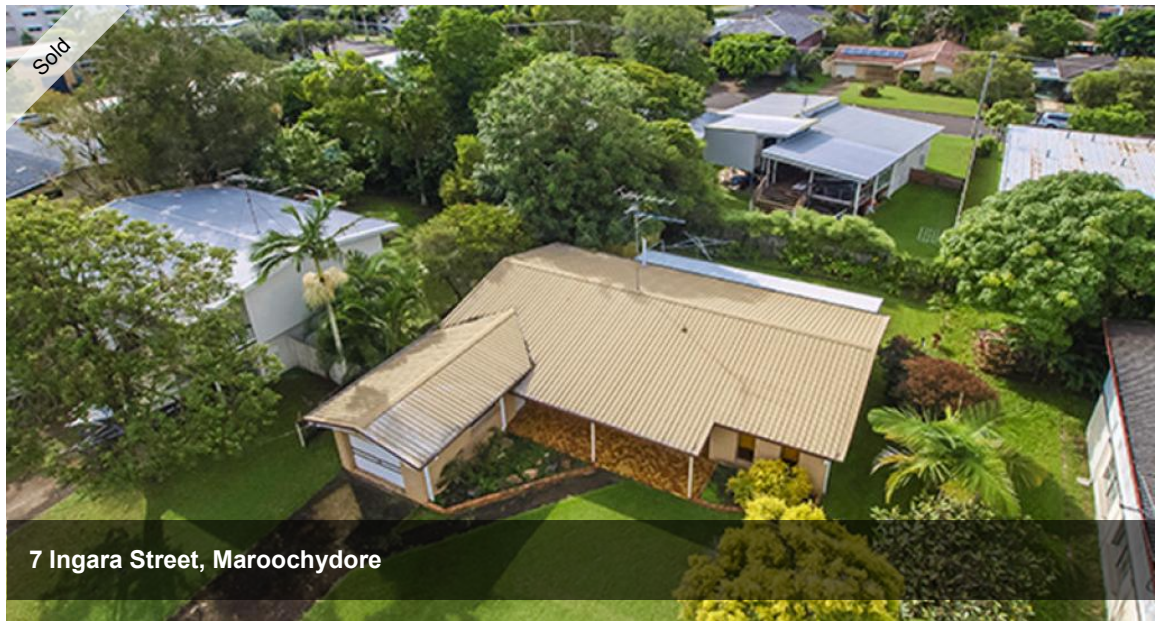
7 Ingara Street, Maroochydore