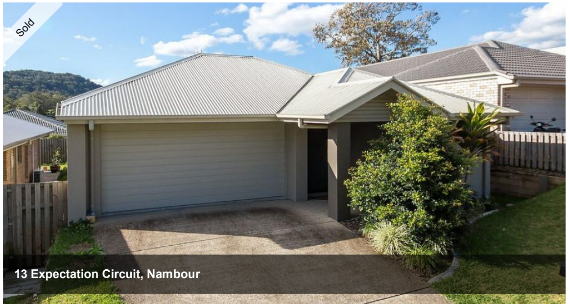
13 Expectation Circuit, Nambour