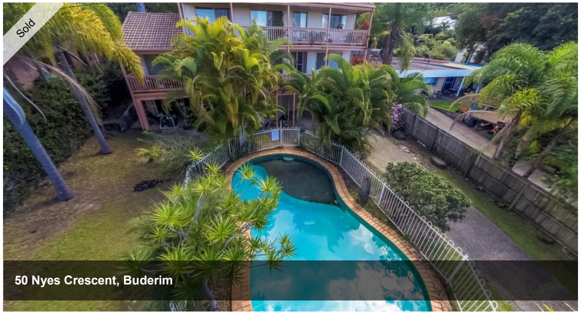
50 Nyes Crescent, Buderim