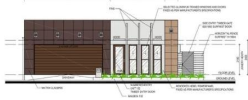
ELEVATION 1 1:100