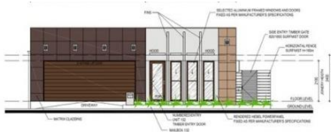
ELEVATION 1 1:100