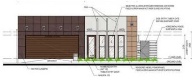
ELEVATION 1 1:100