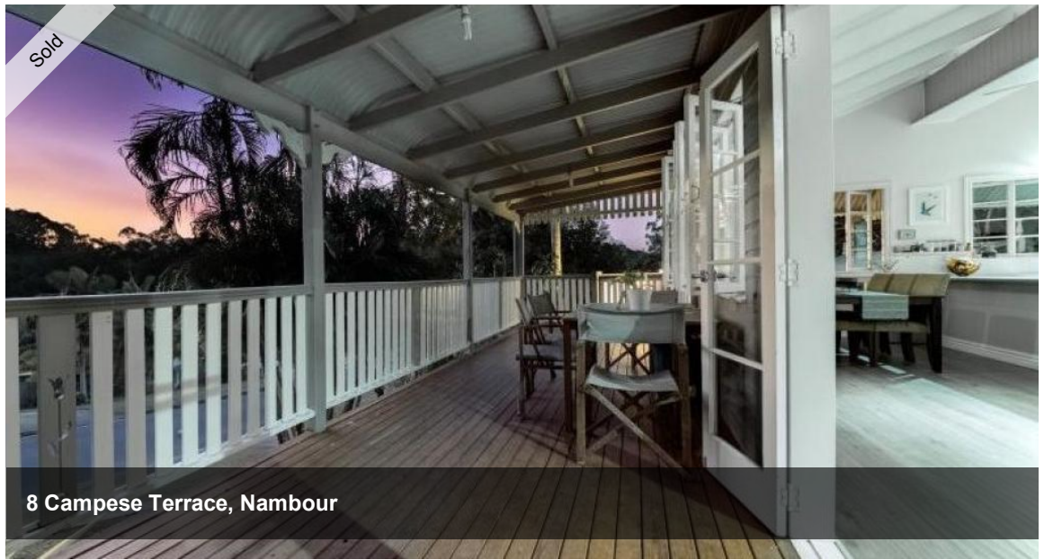
8 Campese Terrace, Nambour