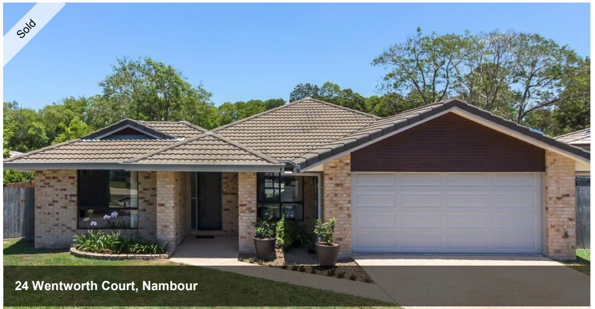
24 Wentworth Court, Nambour