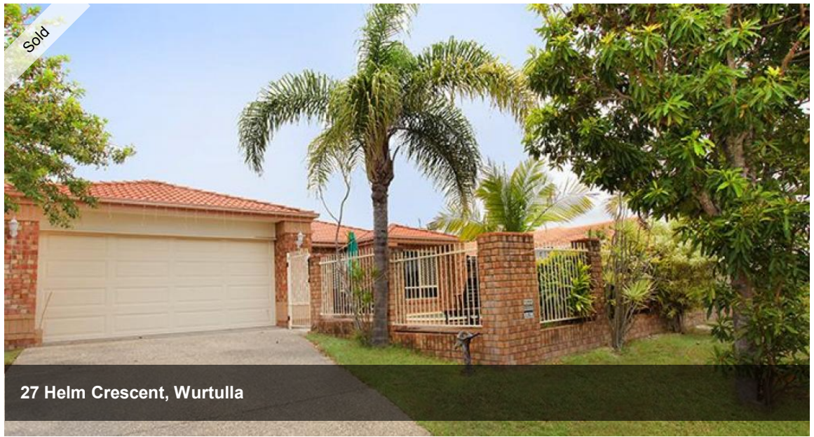
27 Helm Crescent, Wurtulla