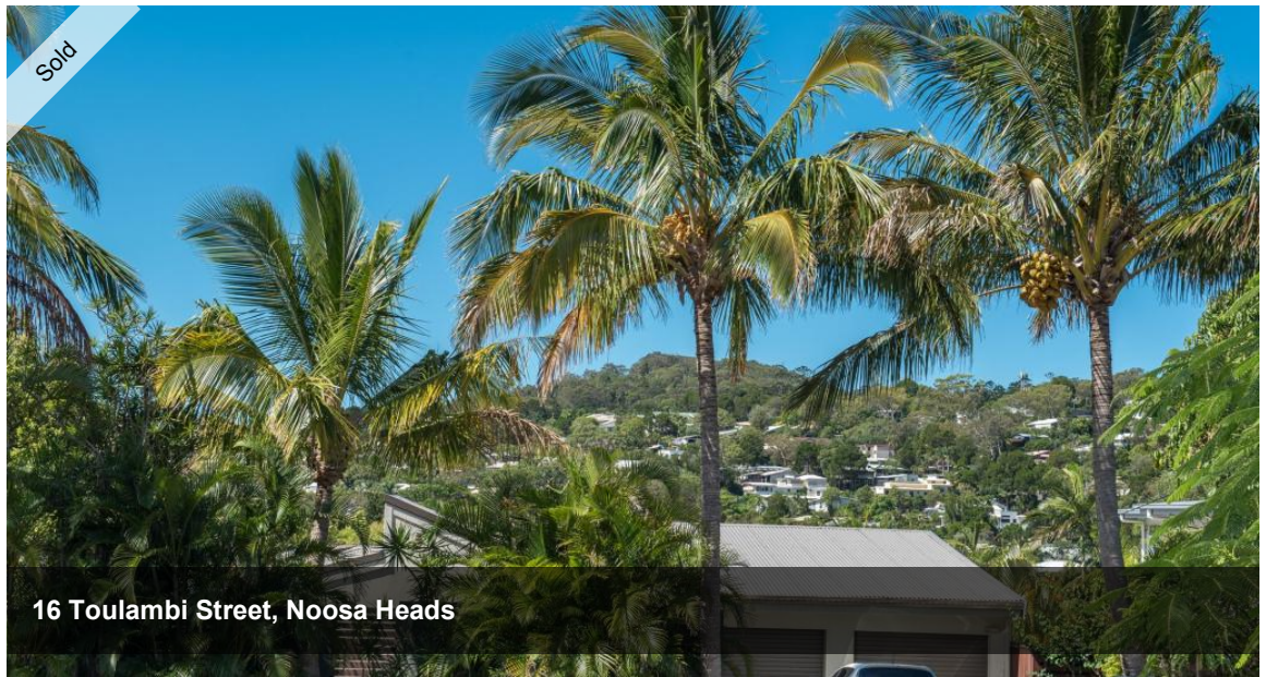
16 Toulambi Street, Noosa Heads