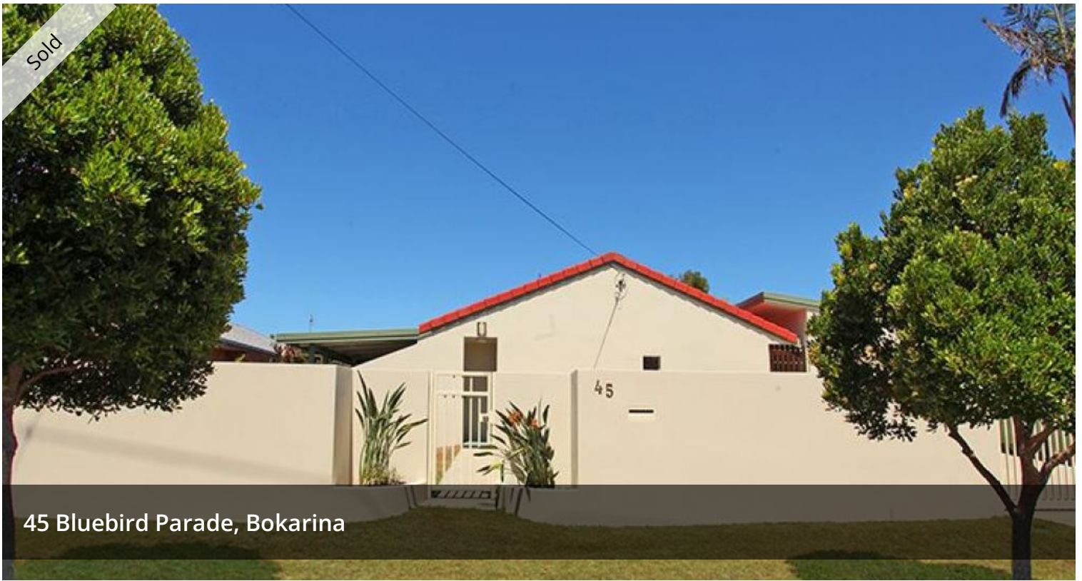
45 Bluebird Parade, Bokarina