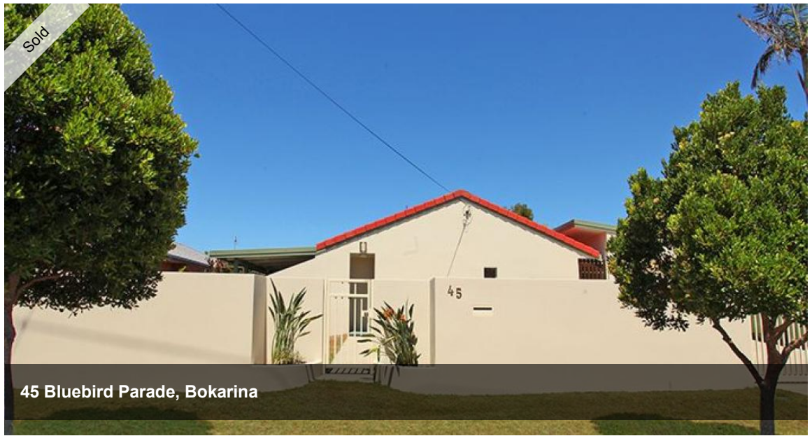
45 Bluebird Parade, Bokarina