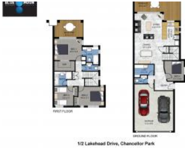
1/2 Lakehead Drive, Chancellor Park