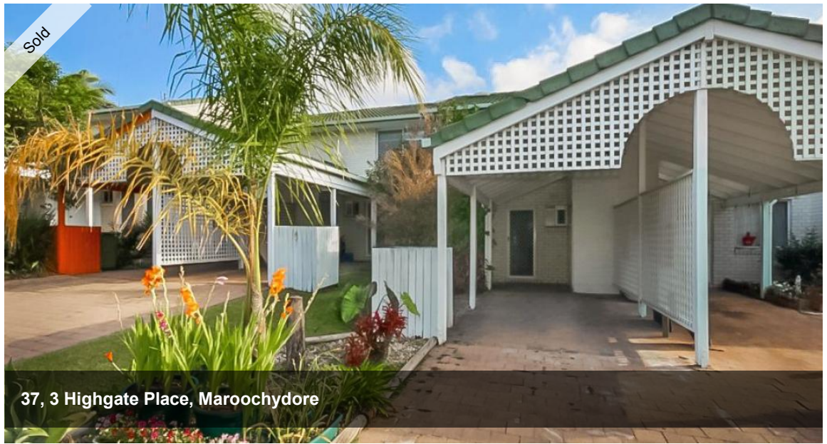
37, 3 Highgate Place, Maroochydore