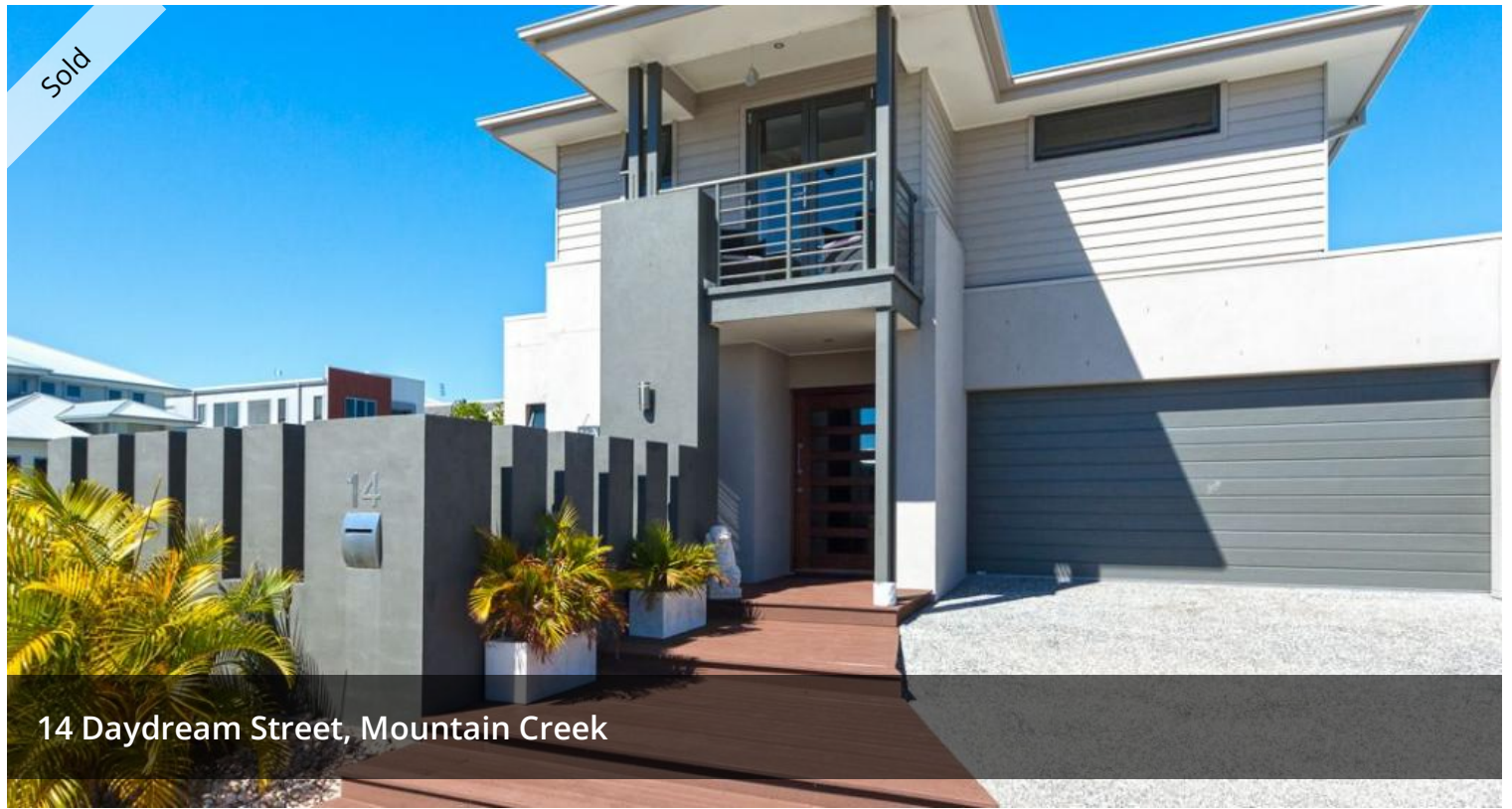
14 Daydream Street, Mountain Creek