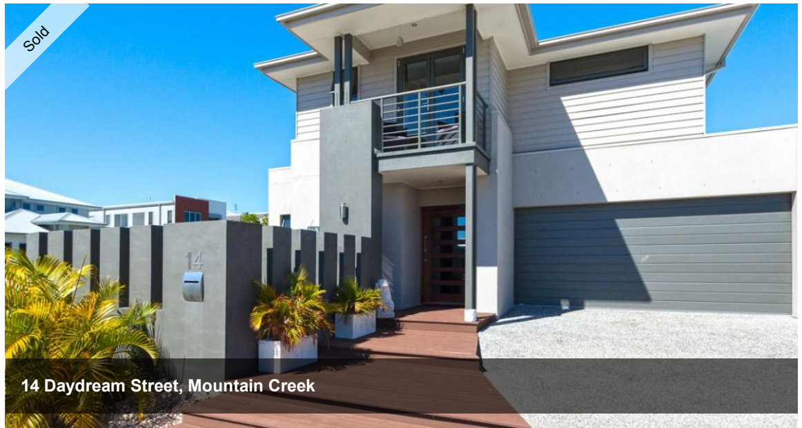
14 Daydream Street, Mountain Creek