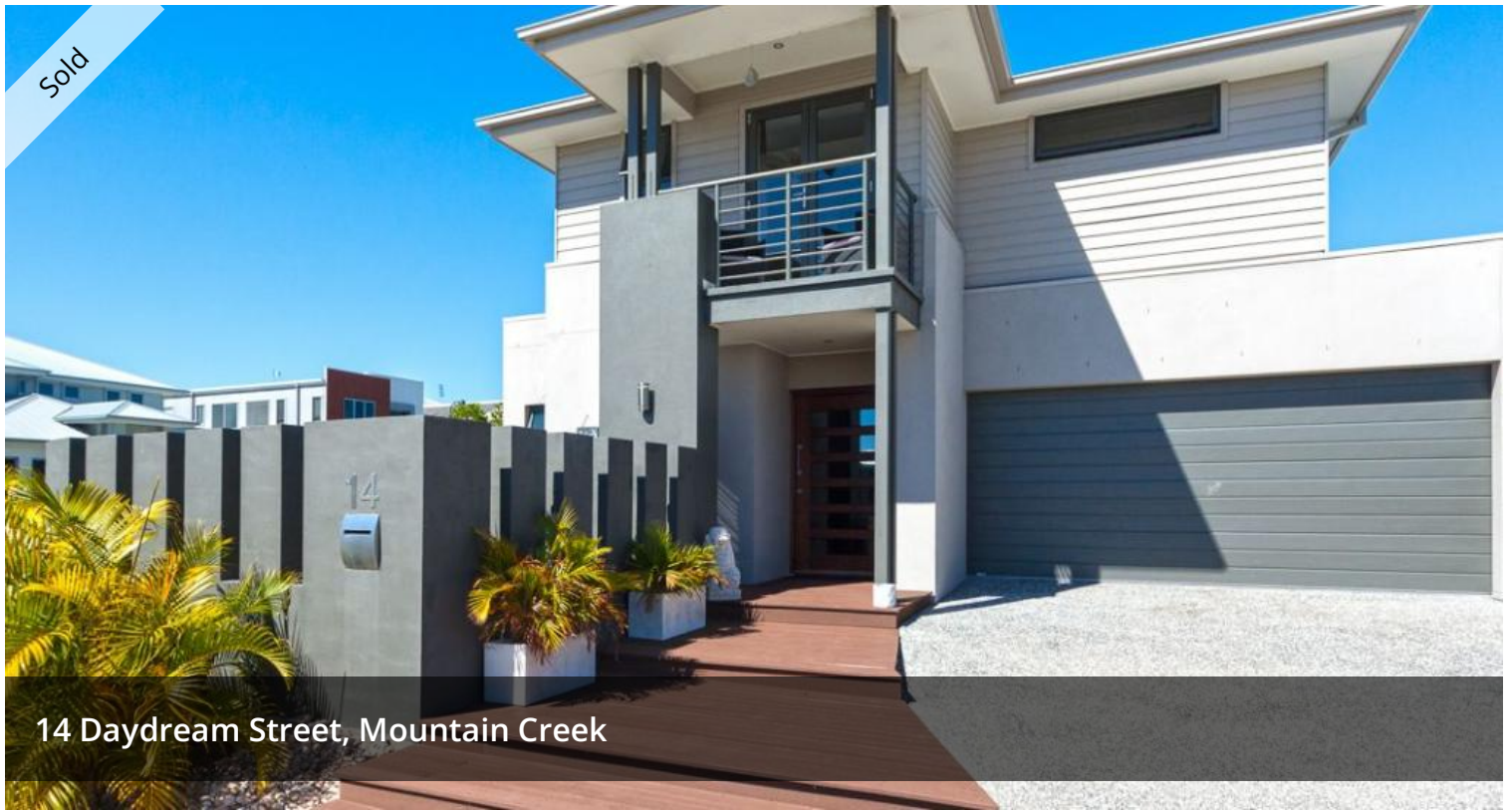
14 Daydream Street, Mountain Creek