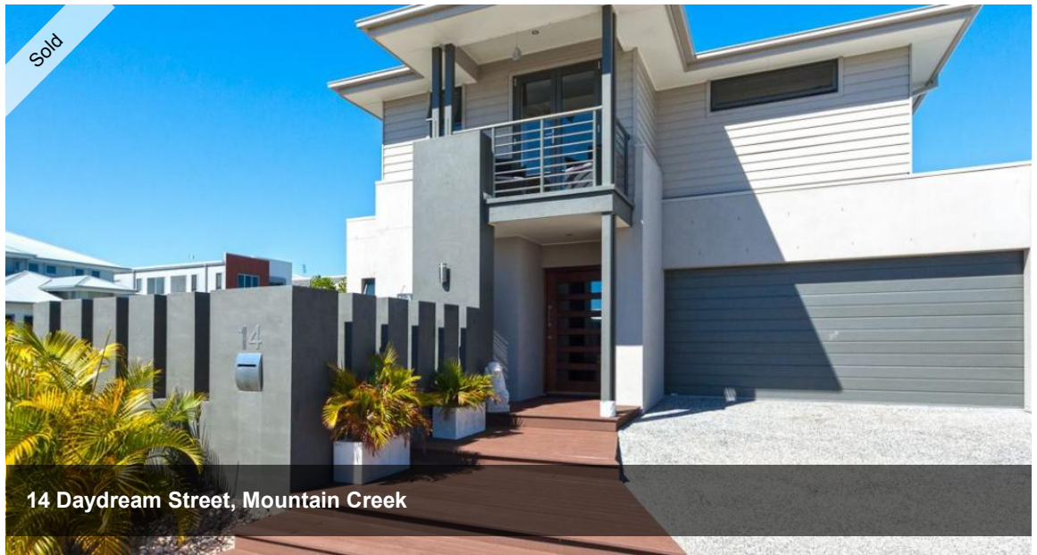
14 Daydream Street, Mountain Creek