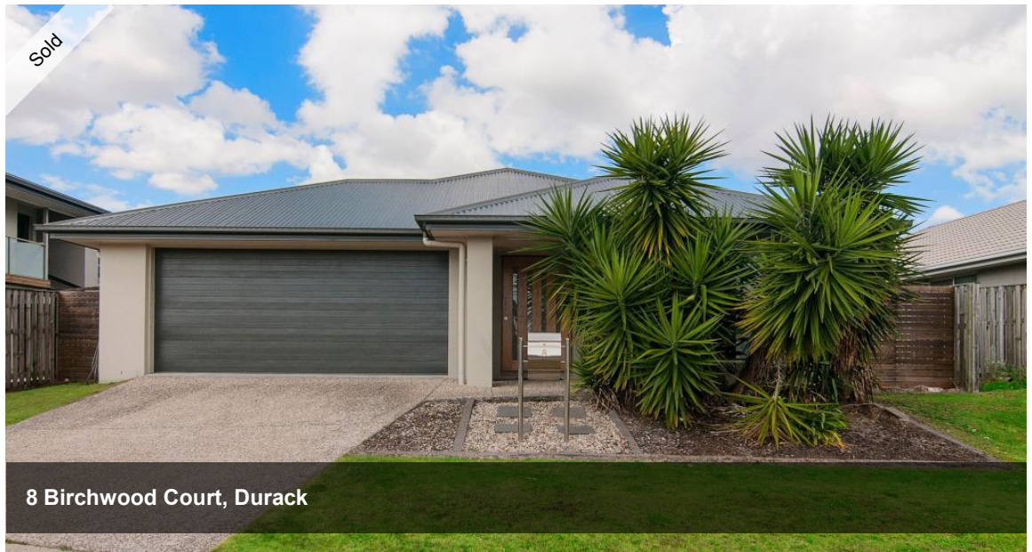
8 Birchwood Court, Durack