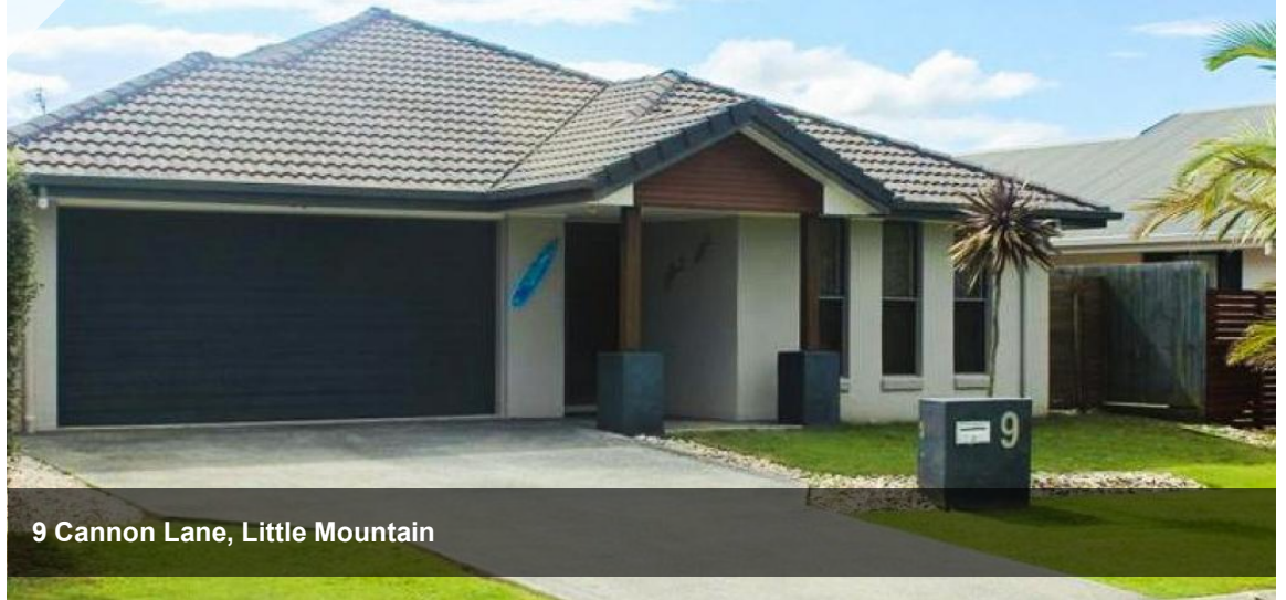
9 Cannon Lane, Little Mountain