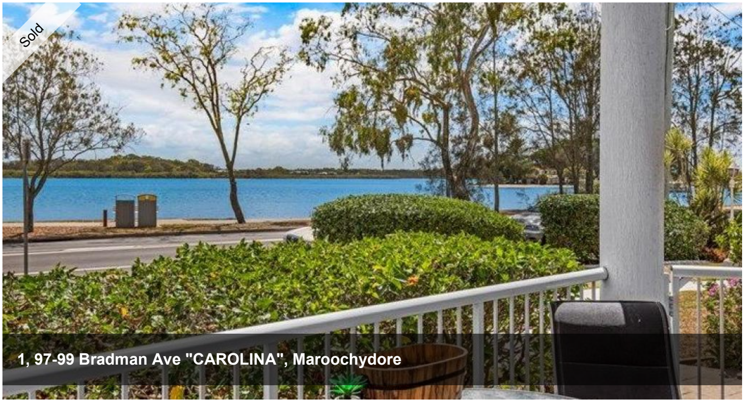
1, 97-99 Bradman Ave "CAROLINA", Maroochydore