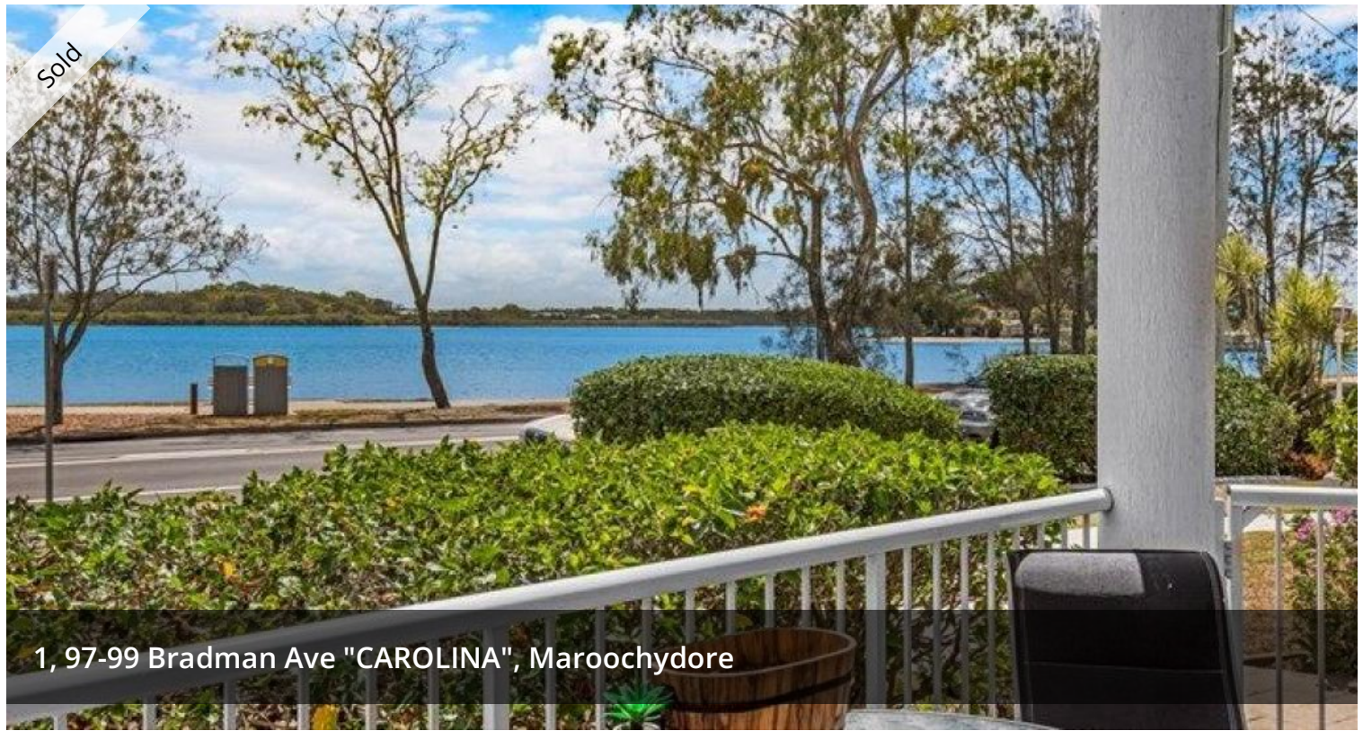
1, 97-99 Bradman Ave "CAROLINA", Maroochydore