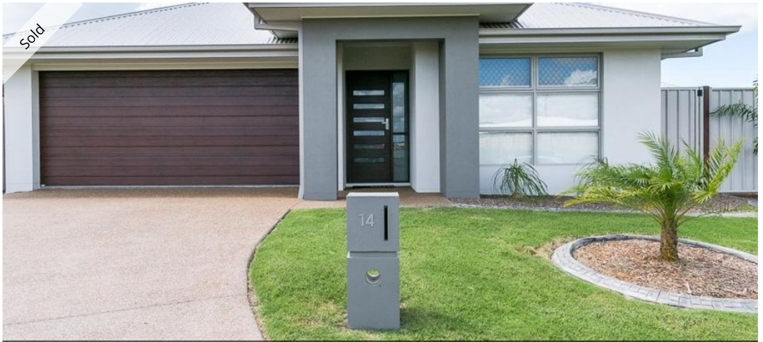
14 Seahaven Circuit, Pialba