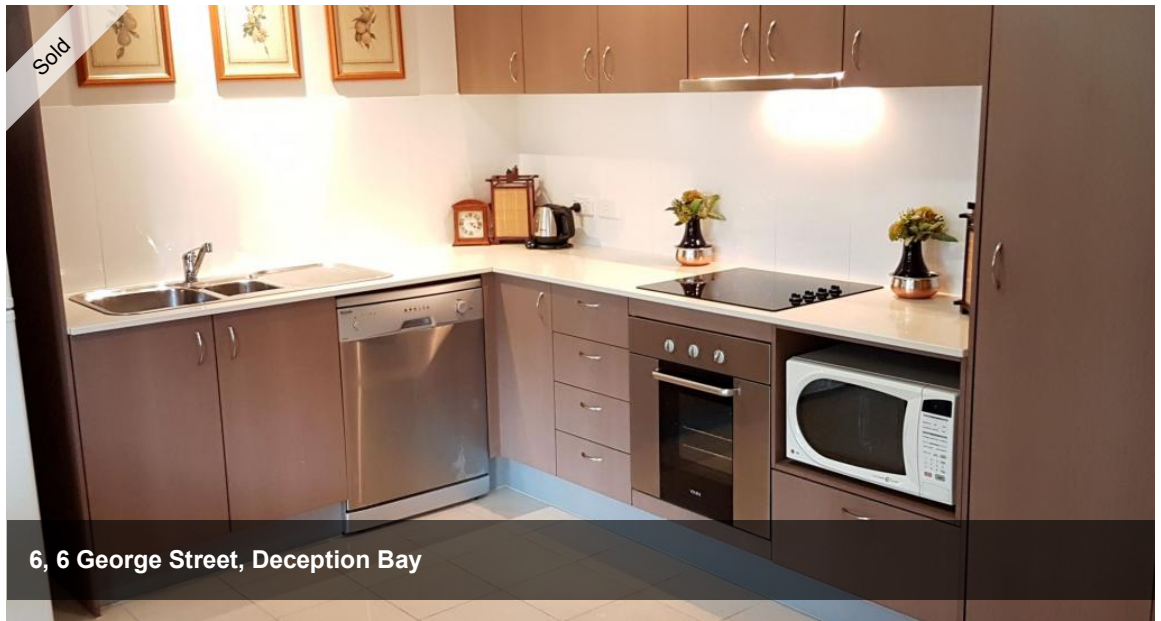
6, 6 George Street, Deception Bay