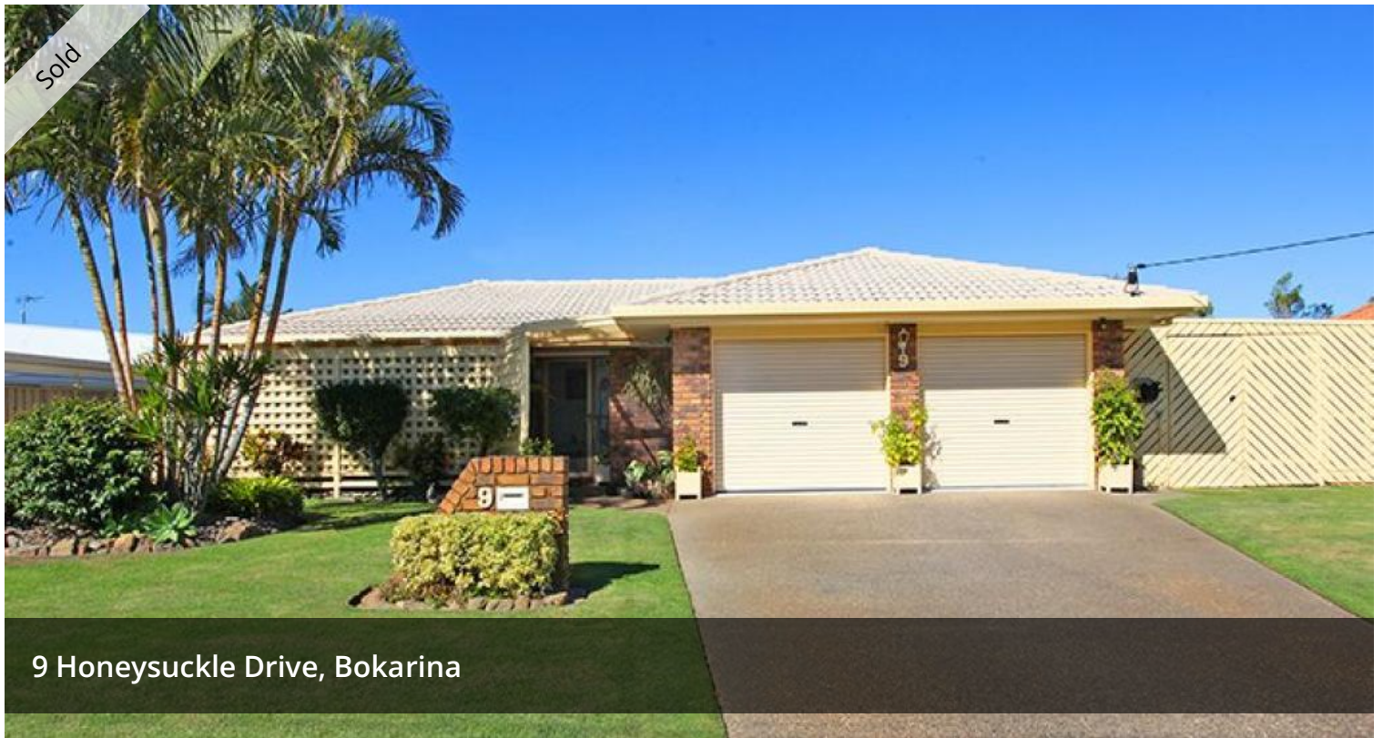
9 Honeysuckle Drive, Bokarina