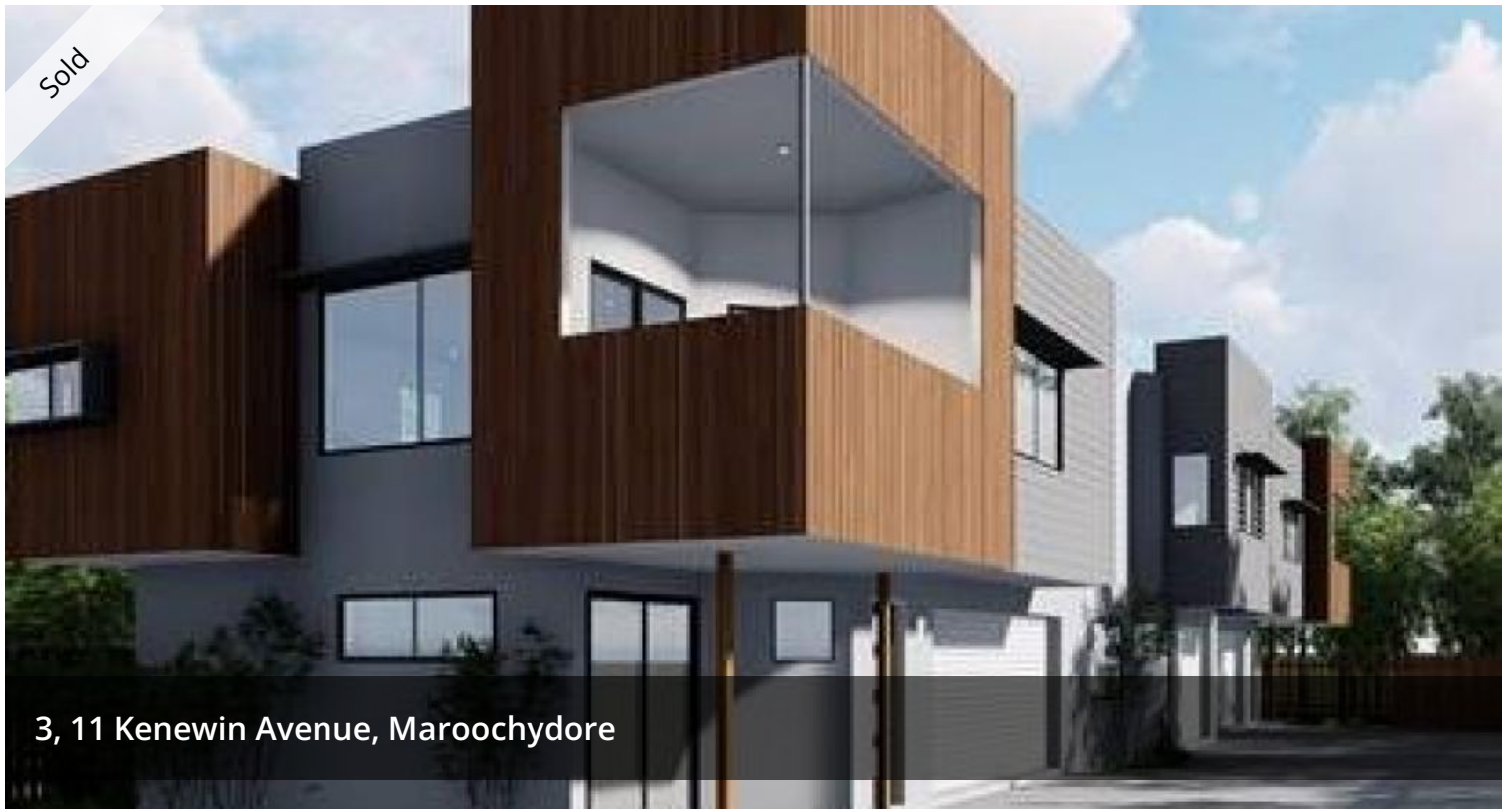
3, 11 Kenewin Avenue, Maroochydore