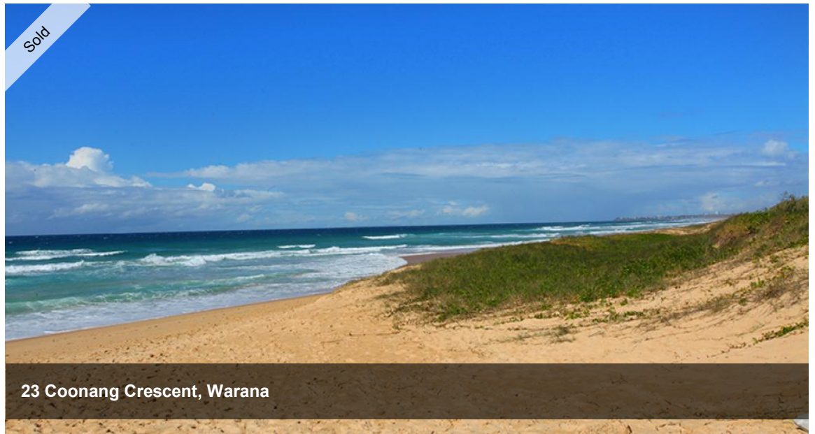
23 Coonang Crescent, Warana