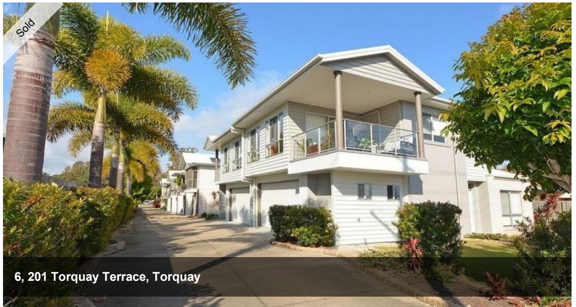
6, 201 Torquay Terrace, Torquay