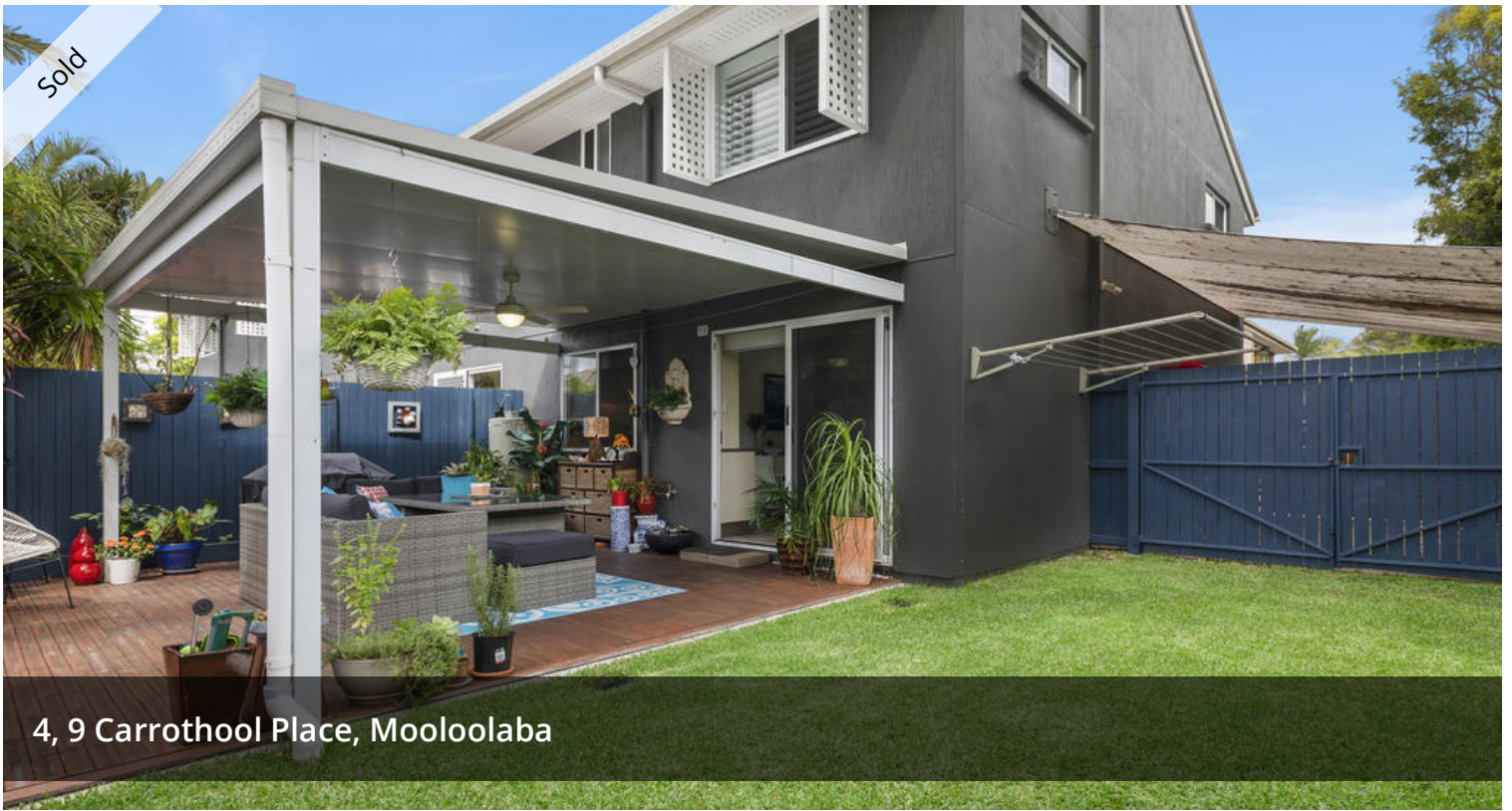
4, 9 Carrothool Place, Mooloolaba