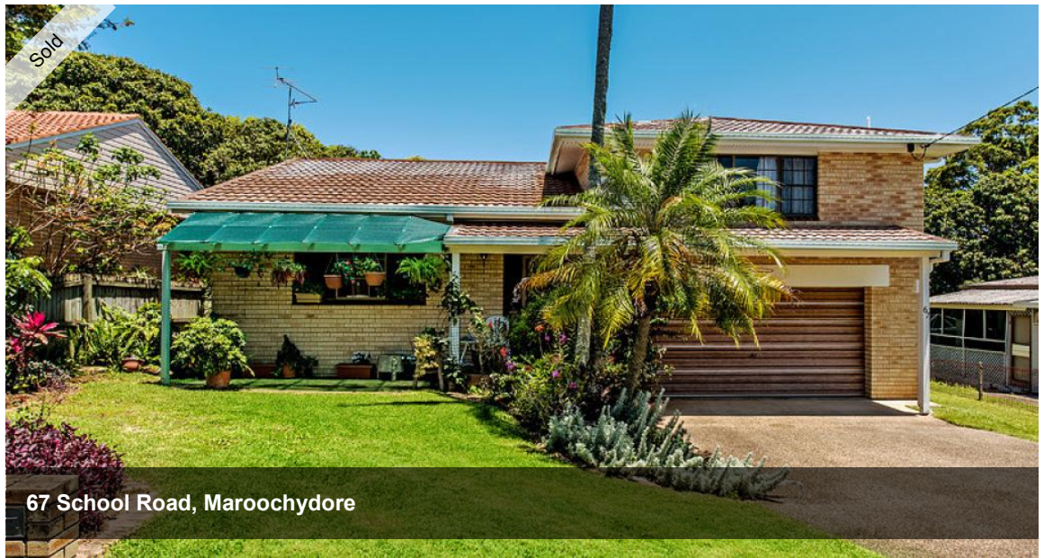
67 School Road, Maroochydore