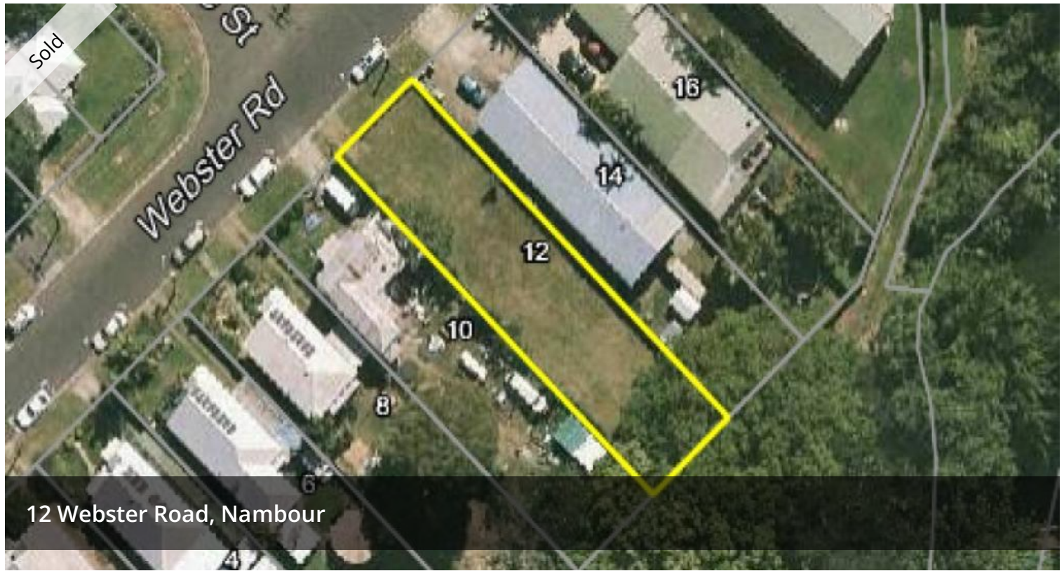
12 Webster Road, Nambour