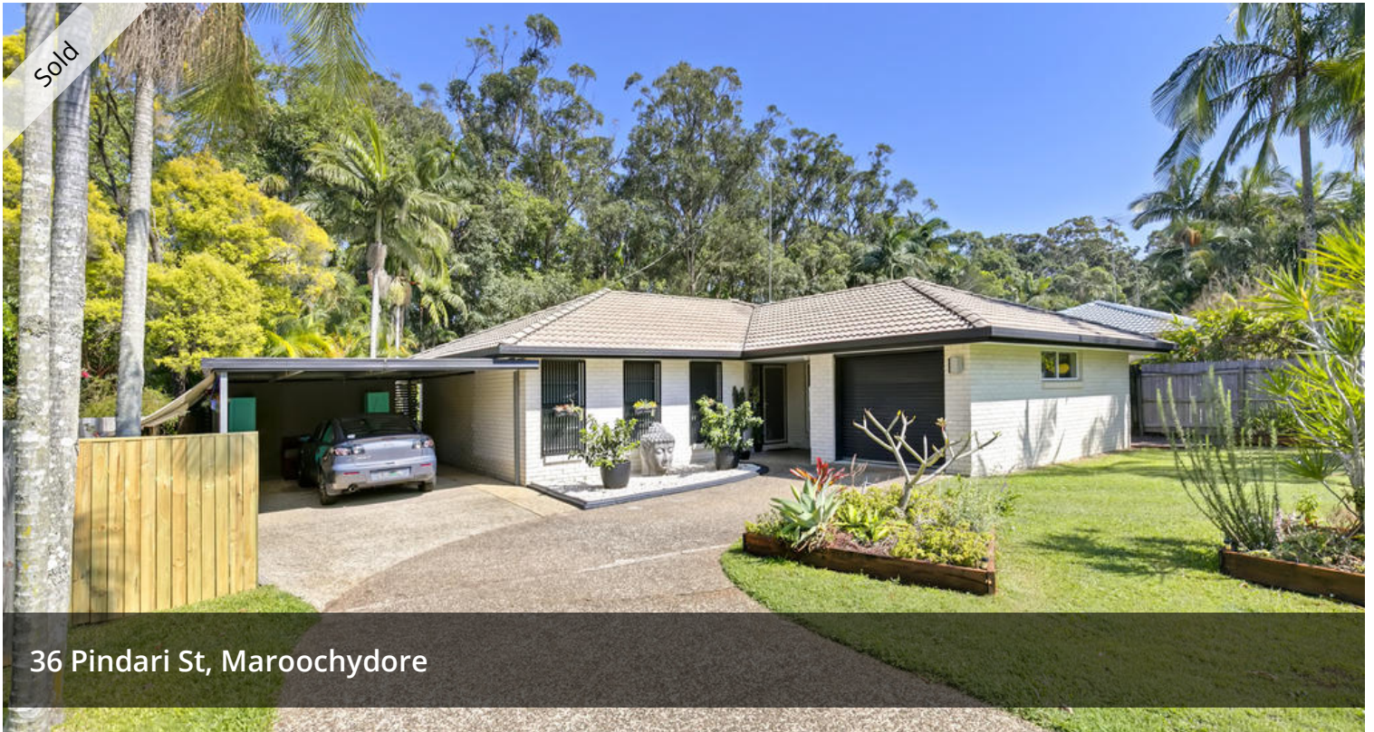
36 Pindari St, Maroochydore