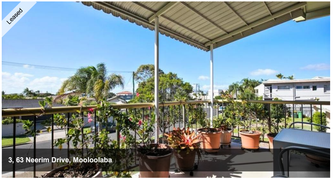
3, 63 Neerim Drive, Mooloolaba