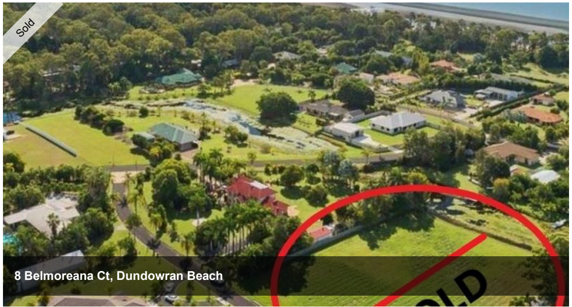
8 Belmoreana Ct, Dundowran Beach