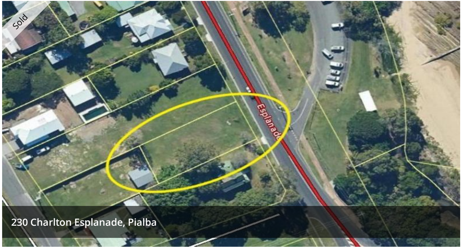
230 Charlton Esplanade, Pialba