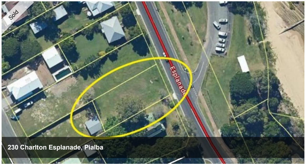
230 Charlton Esplanade, Pialba