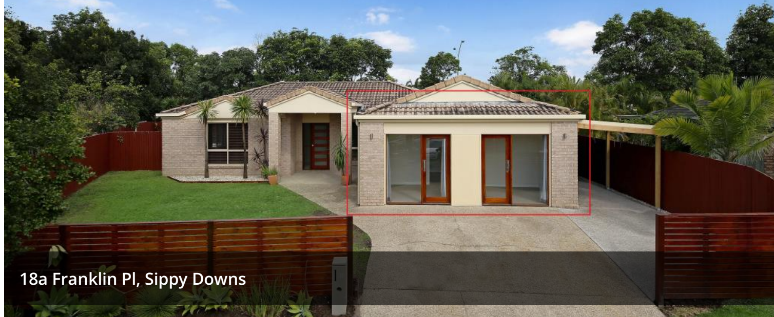
18a Franklin Pl, Sippy Downs