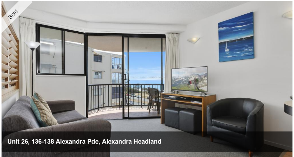
Unit 26, 136-138 Alexandra Pde, Alexandra Headland