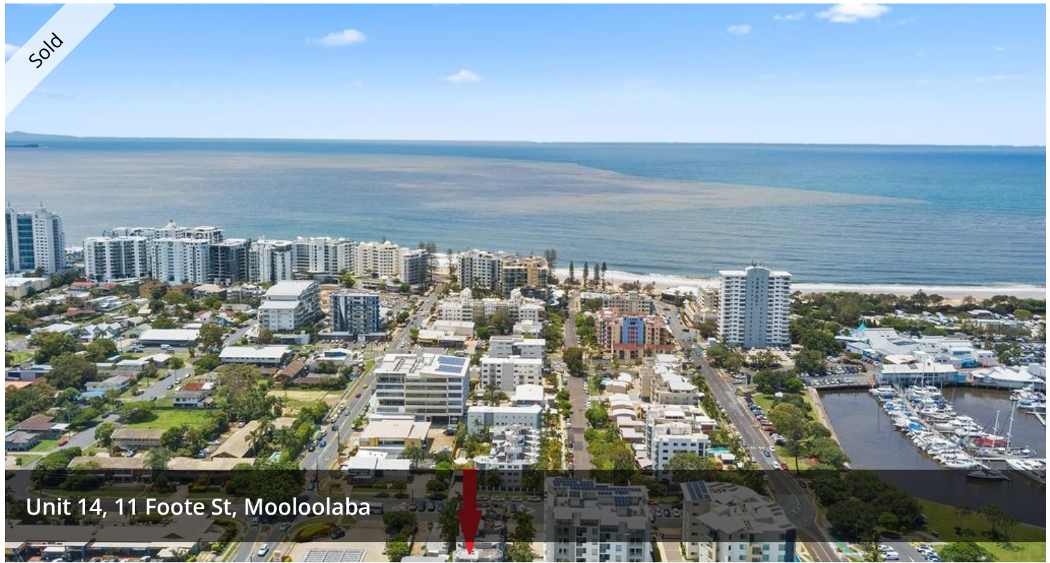
Unit 14, 11 Foote St, Mooloolaba