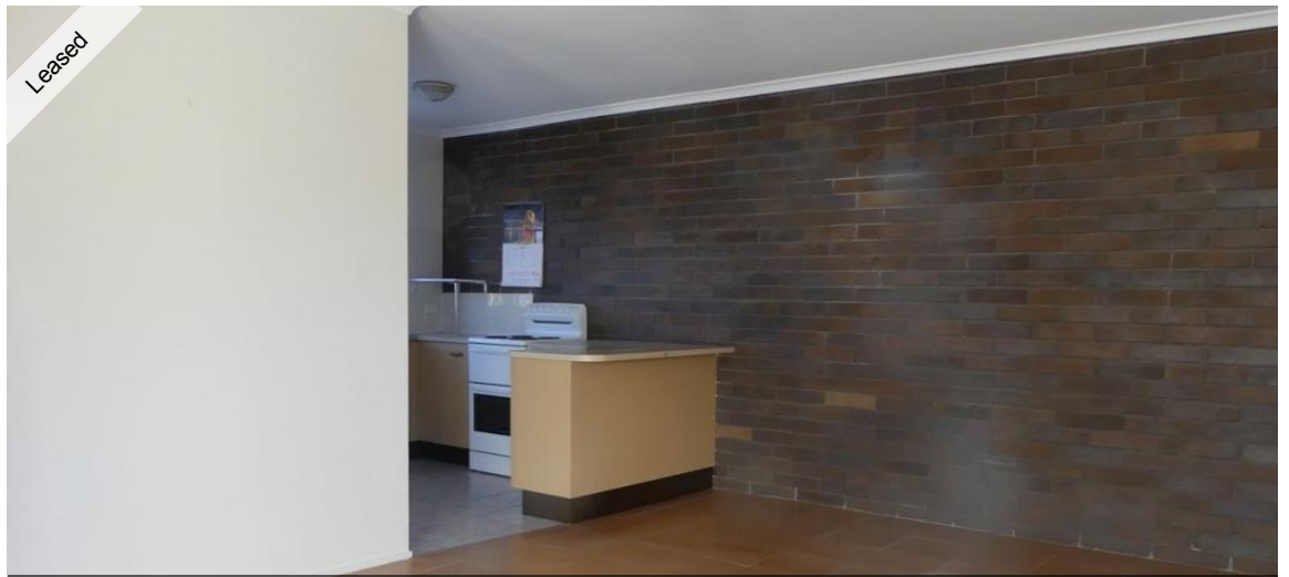
Unit 1/14 Amanda Ave, Marcoola