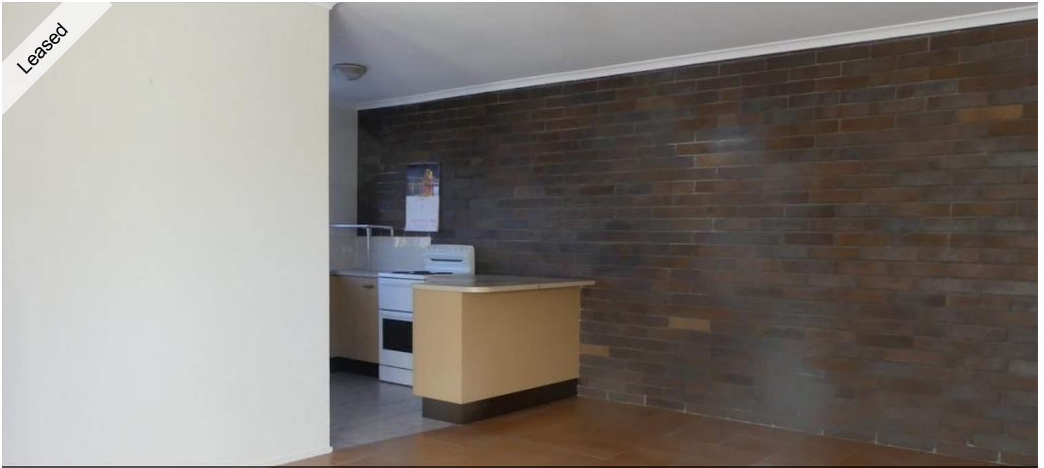
Unit 1/14 Amanda Ave, Marcoola