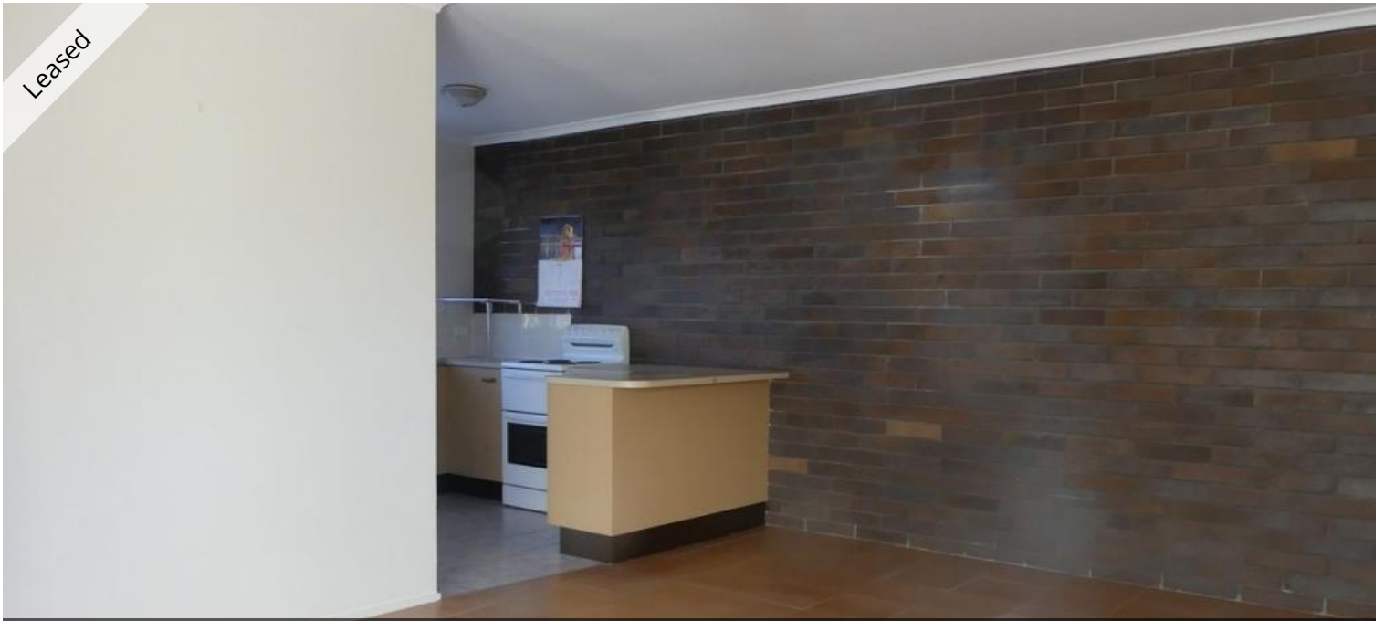
Unit 1/ 14 Amanda Ave, Marcoola