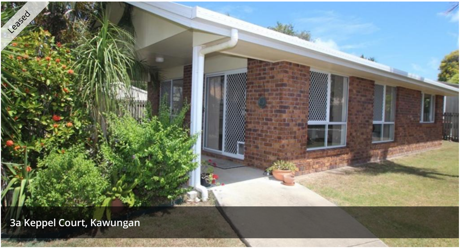
3a Keppel Court, Kawungan