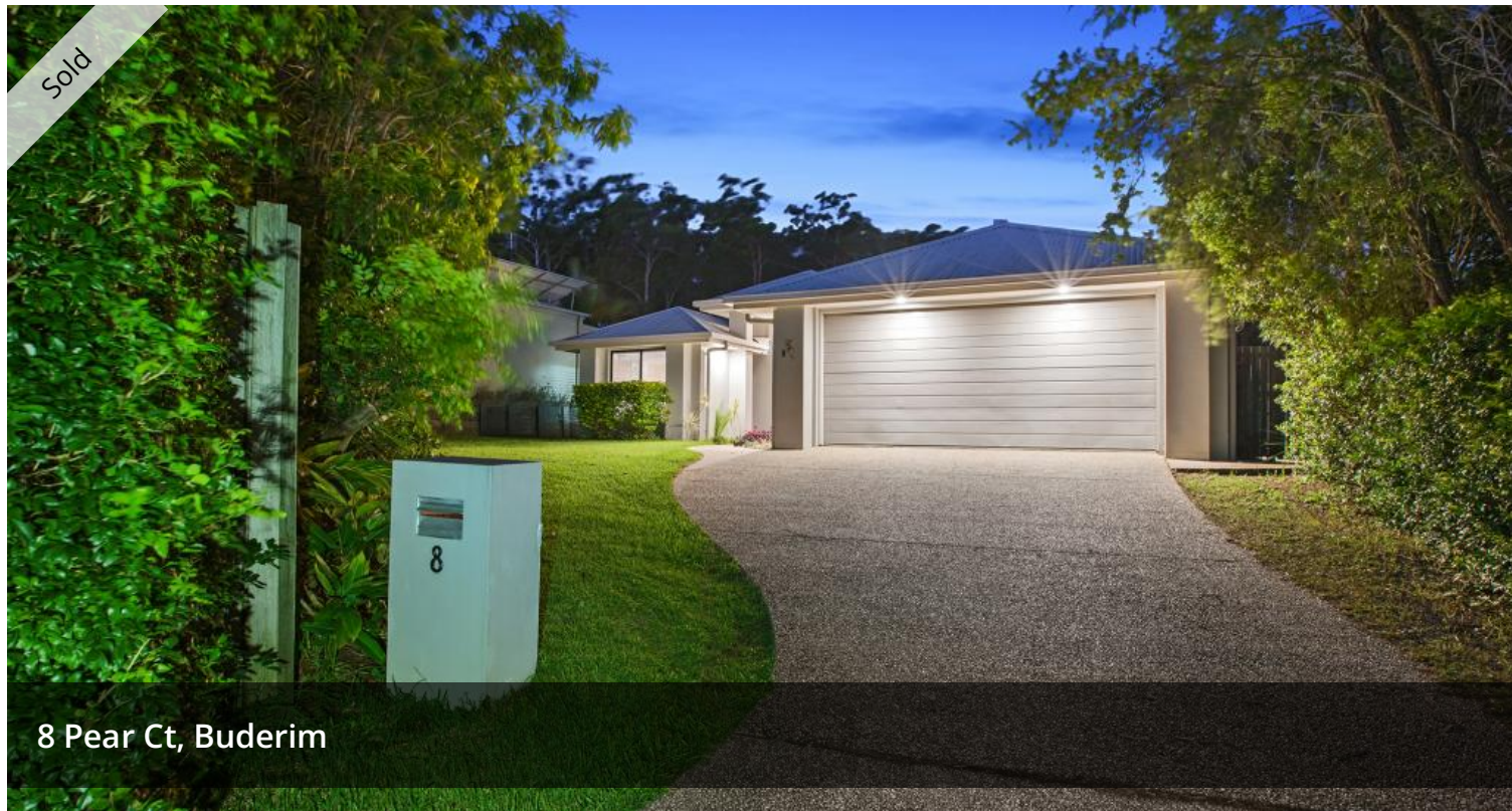
8 Pear Ct, Buderim