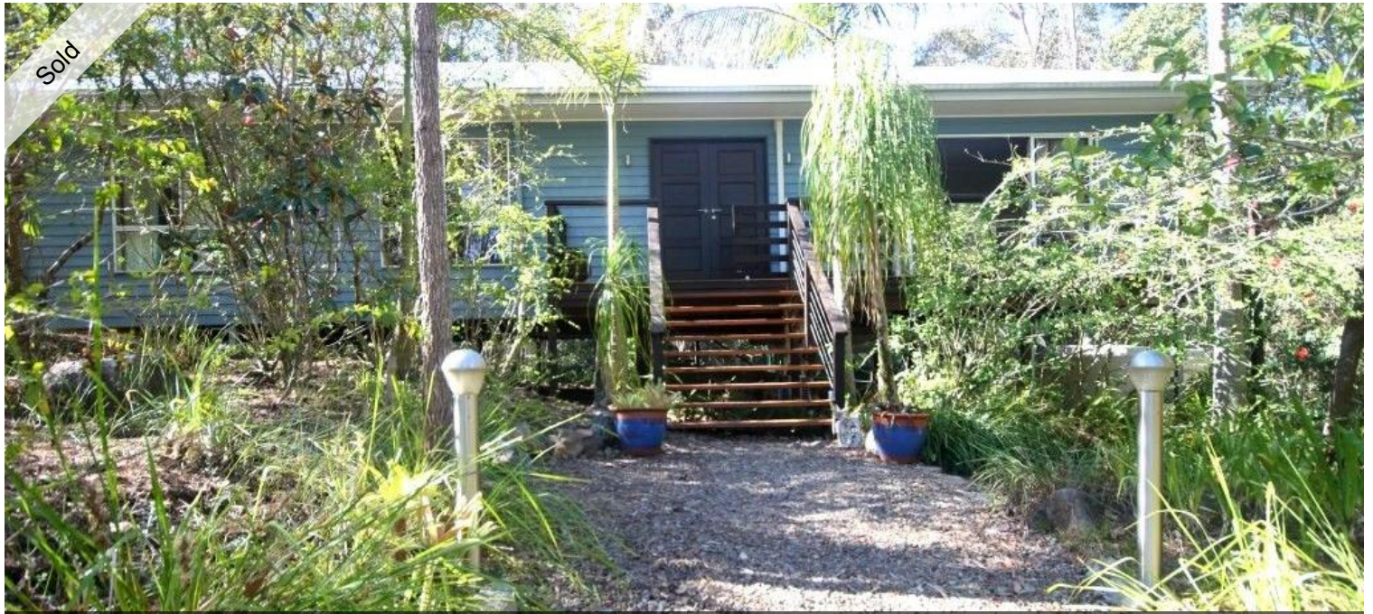
22 White Wood Court, Lake Macdonald