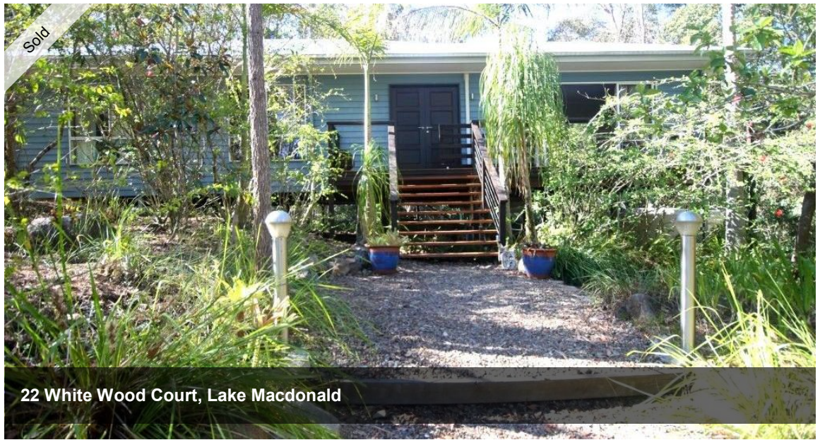
22 White Wood Court, Lake Macdonald