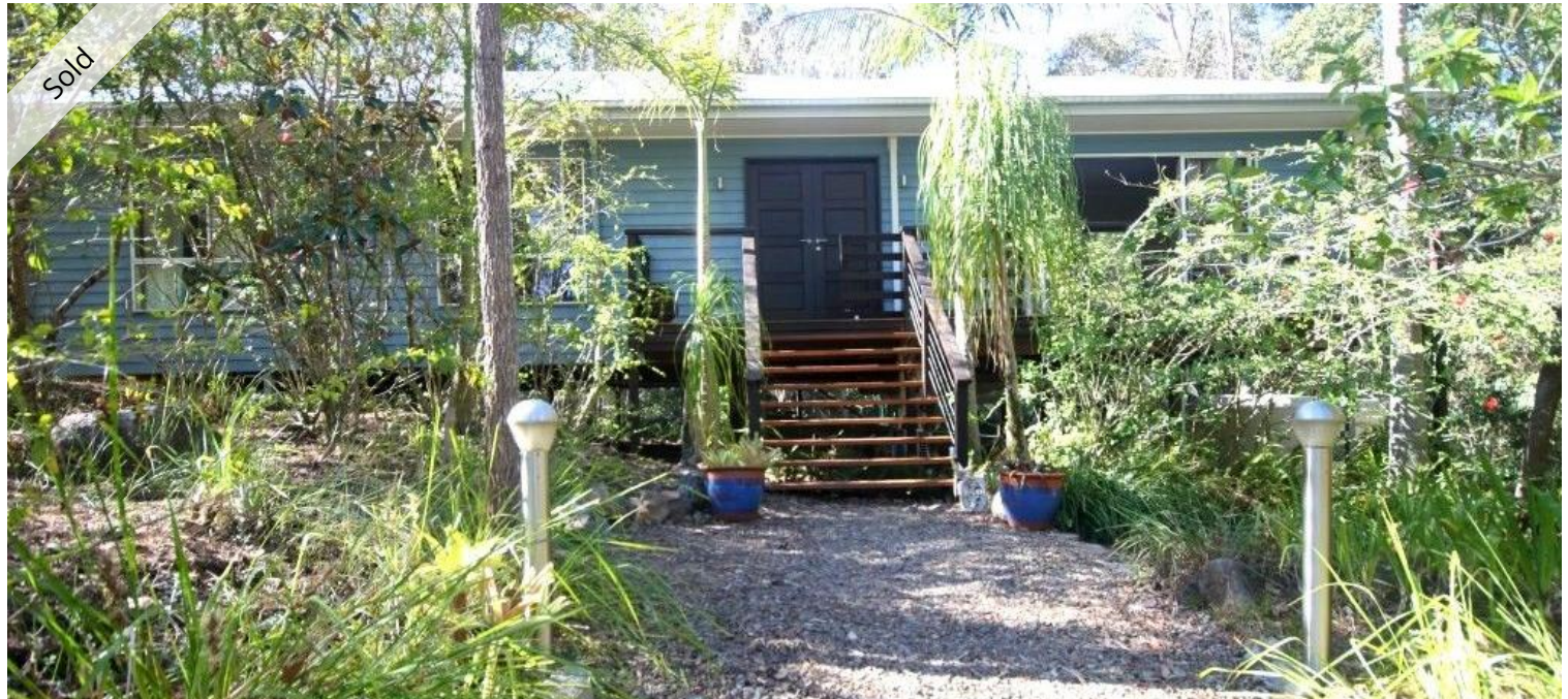
22 White Wood Court, Lake Macdonald