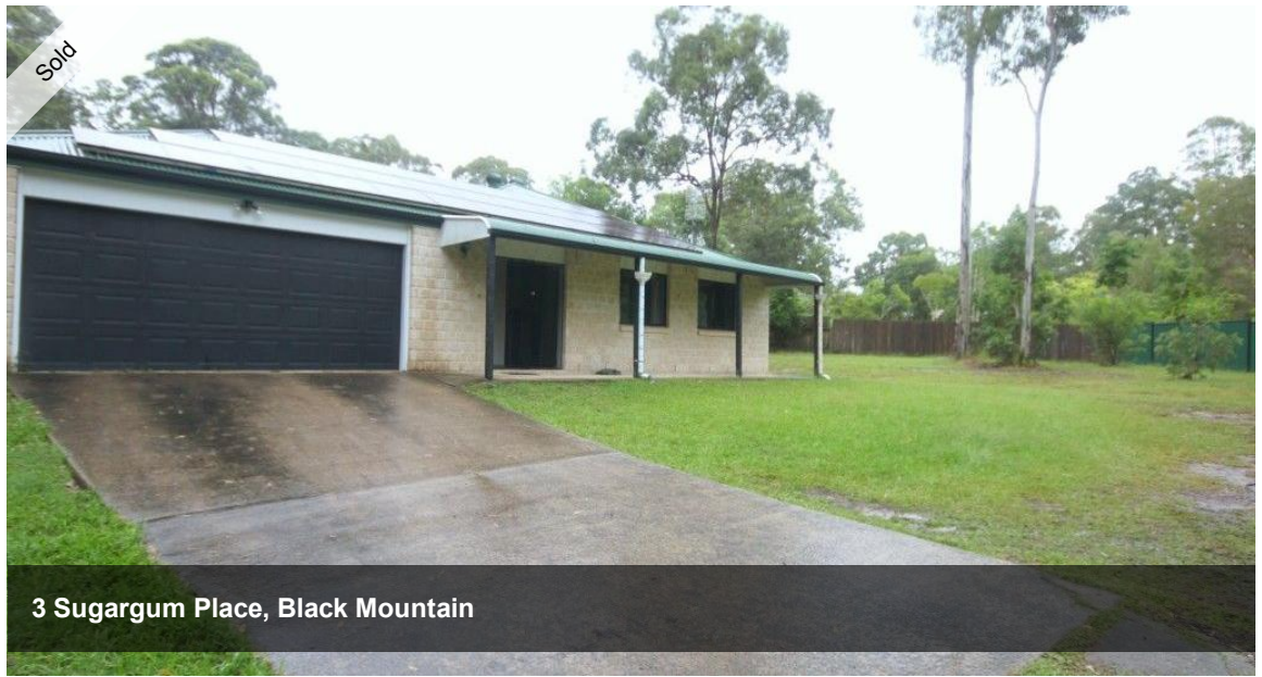
3 Sugargum Place, Black Mountain