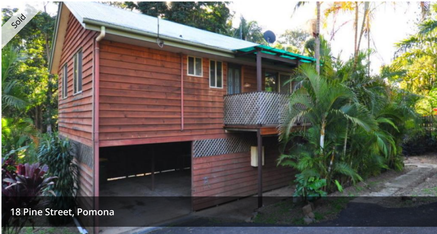
18 Pine Street, Pomona