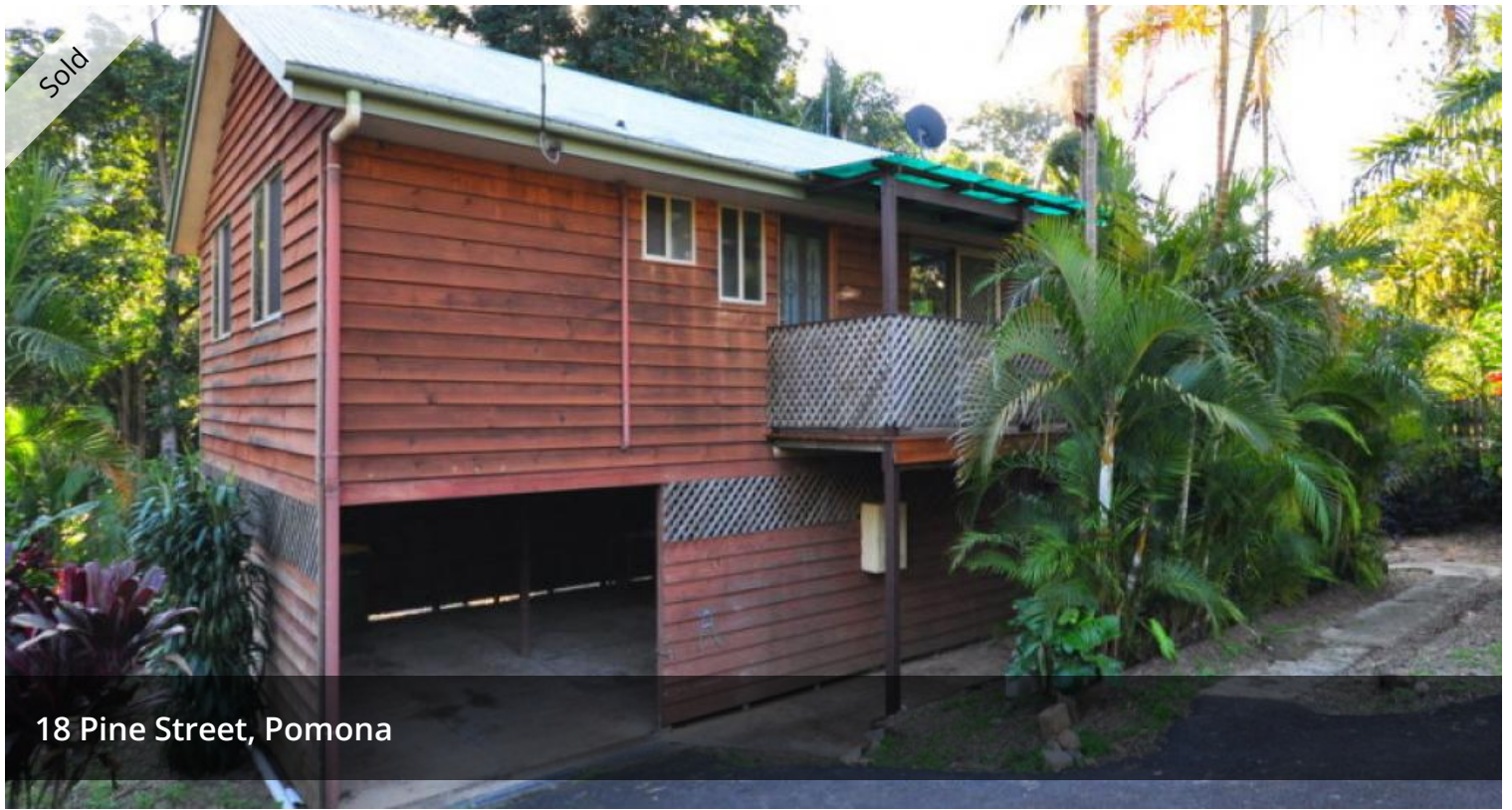
18 Pine Street, Pomona