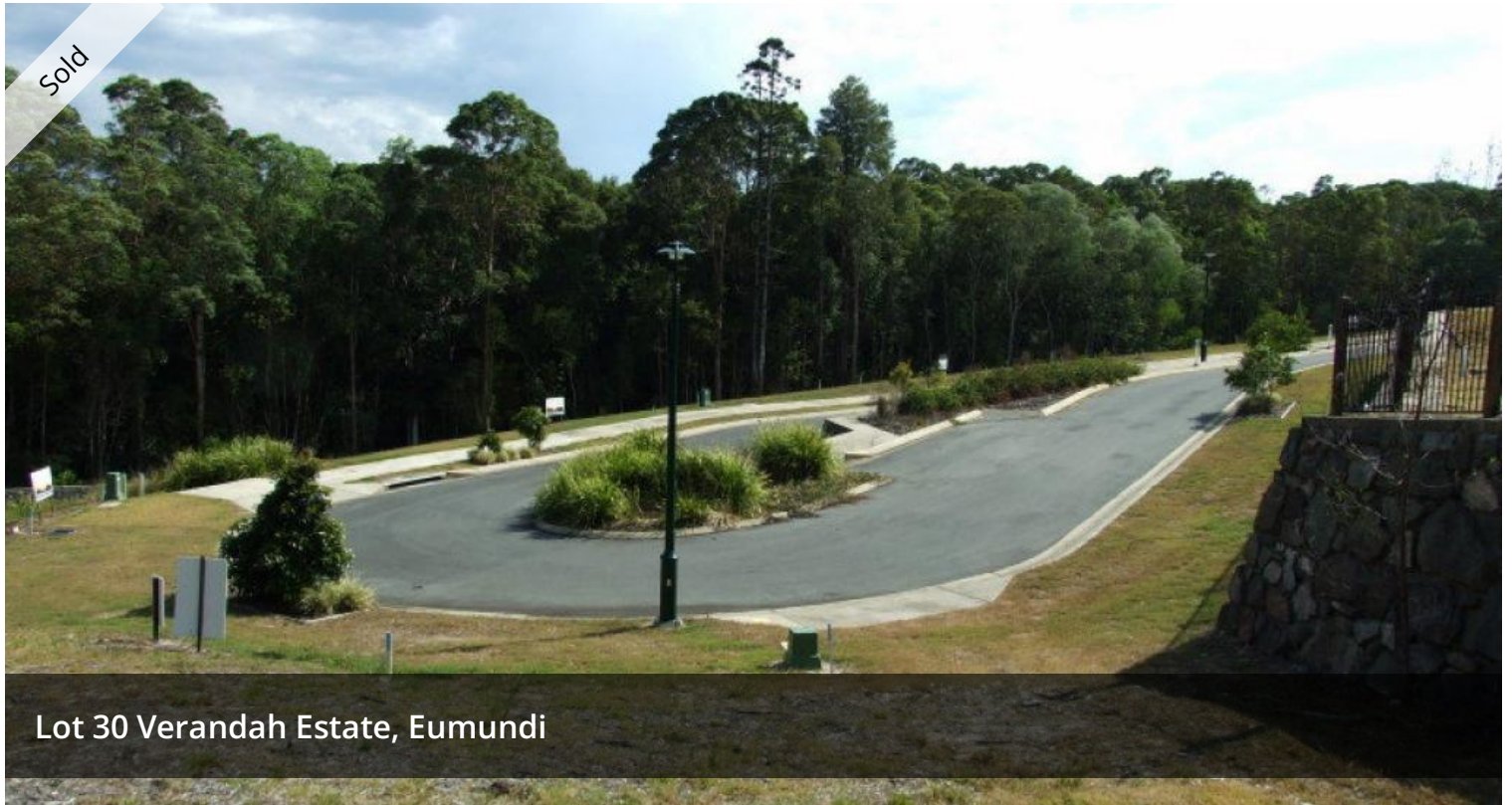
Lot 30 Verandah Estate, Eumundi