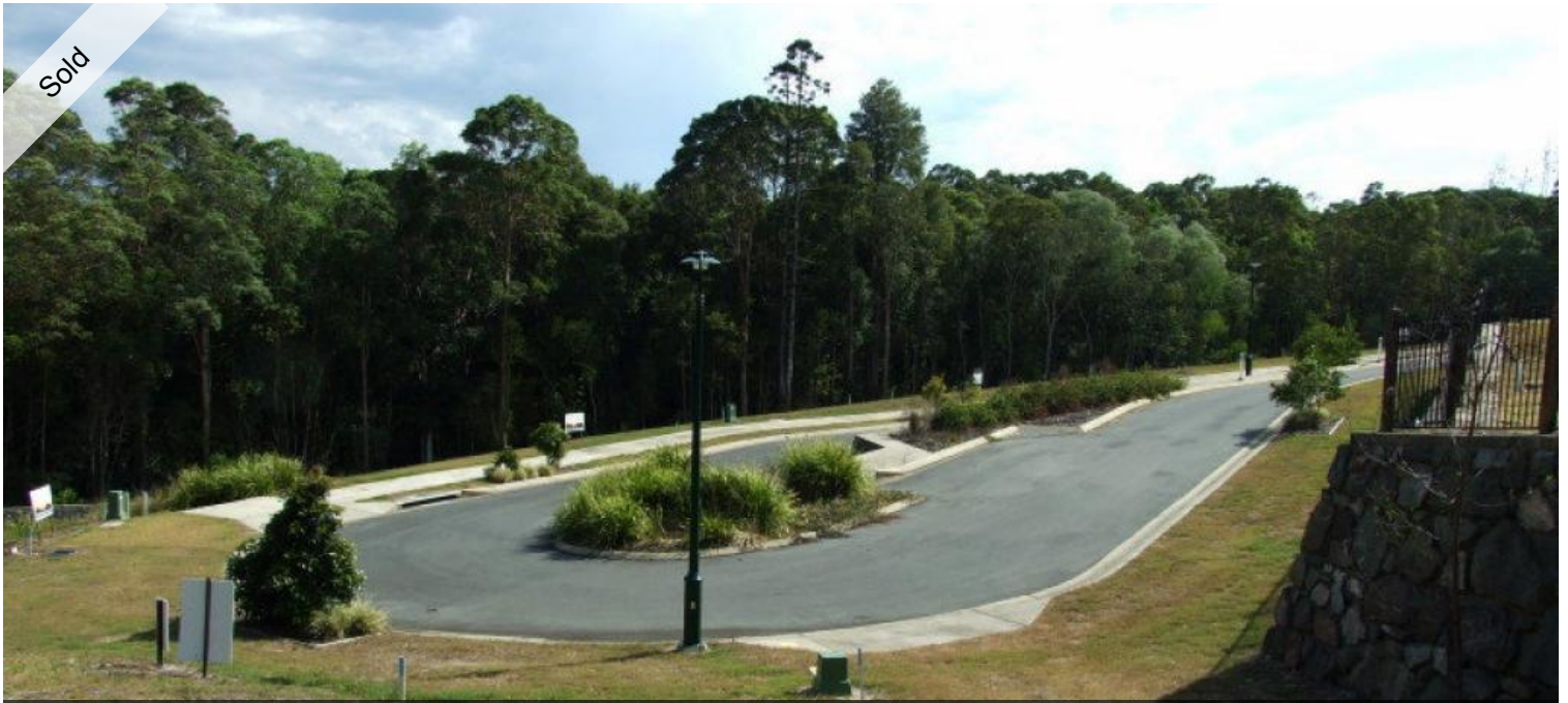
Lot 30 Verandah Estate, Eumundi