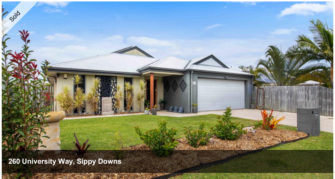
260 University Way, Sippy Downs