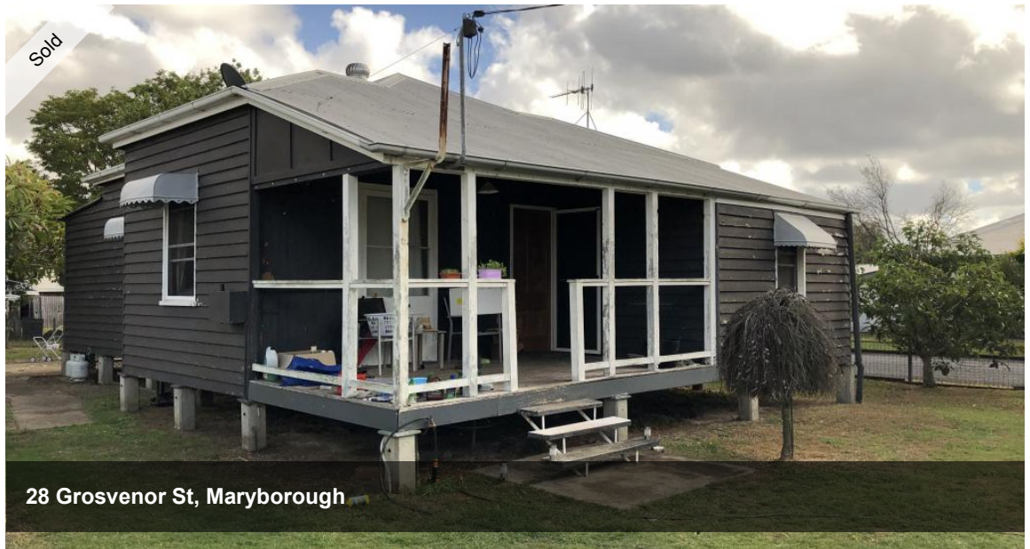
28 Grosvenor St, Maryborough