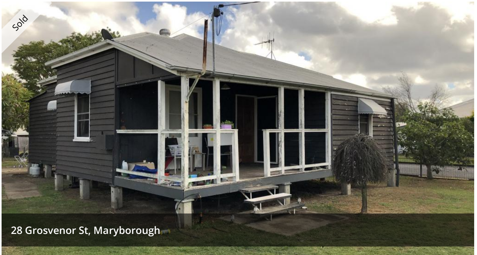
28 Grosvenor St, Maryborough