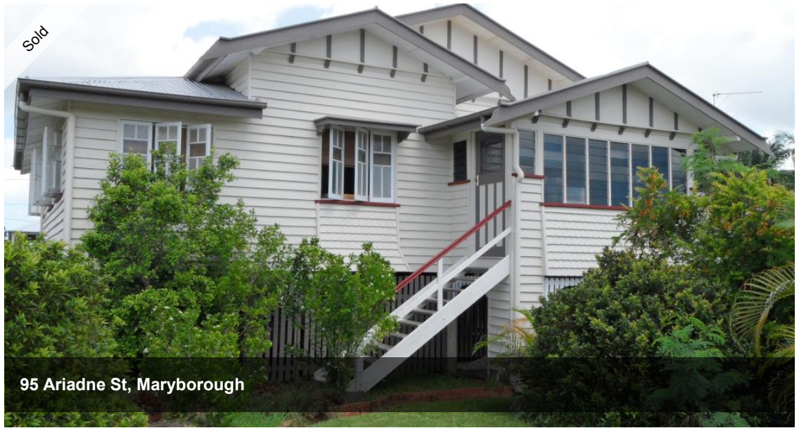
95 Ariadne St, Maryborough