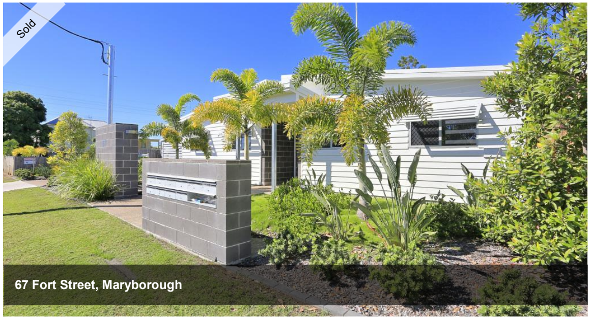
67 Fort Street, Maryborough