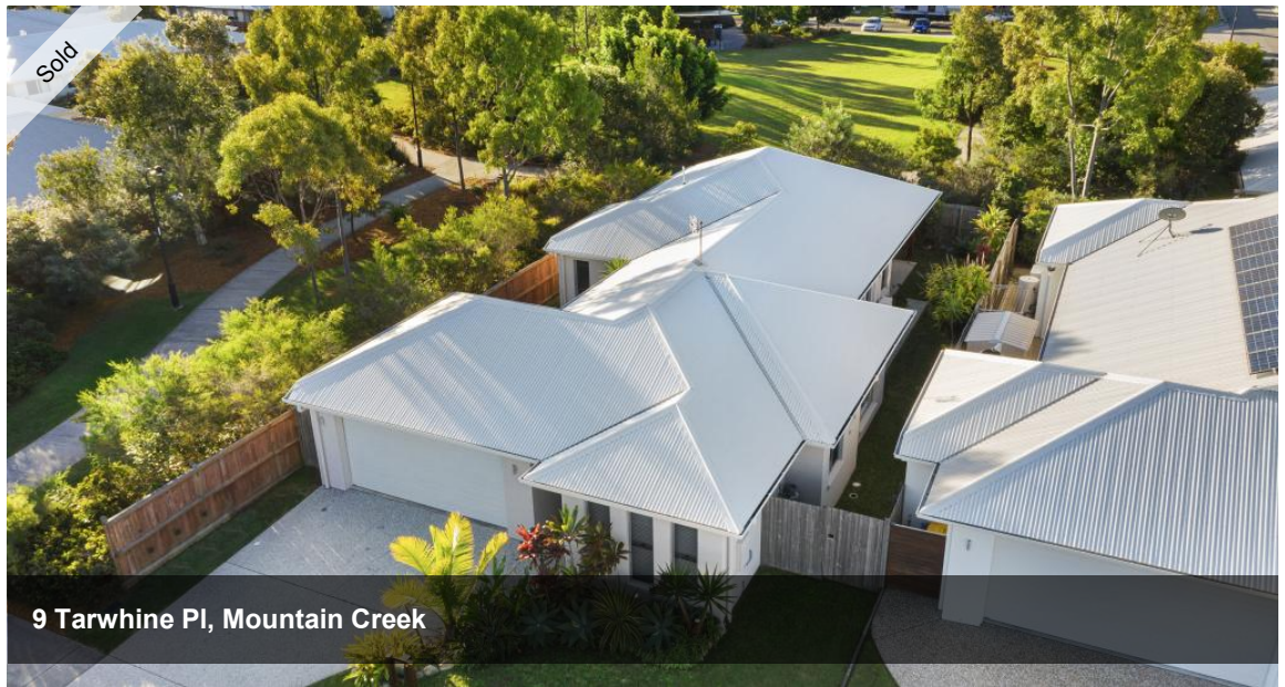
9 Tarwhine Pl, Mountain Creek