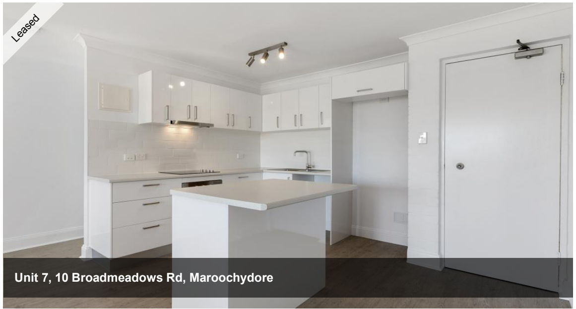
Unit 7, 10 Broadmeadows Rd, Maroochydore