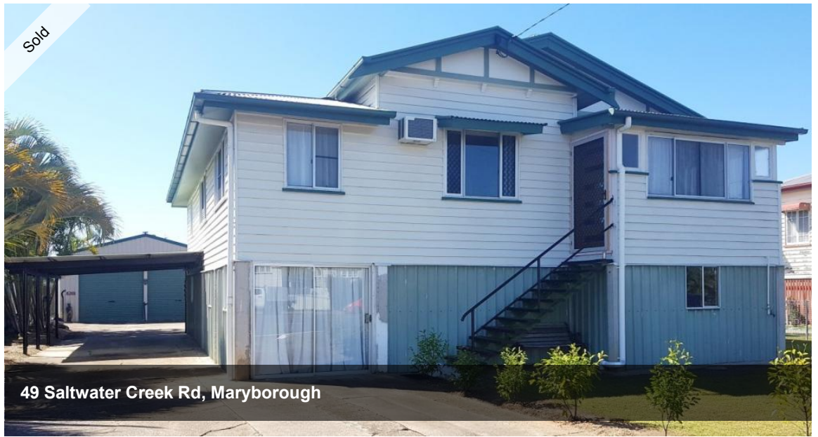
49 Saltwater Creek Rd, Maryborough