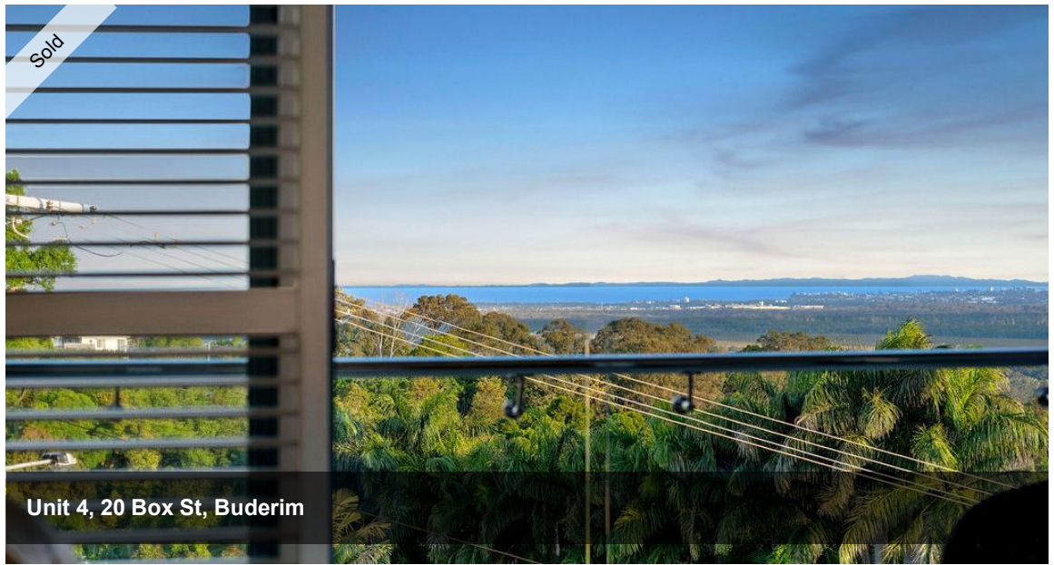
Unit 4, 20 Box St, Buderim